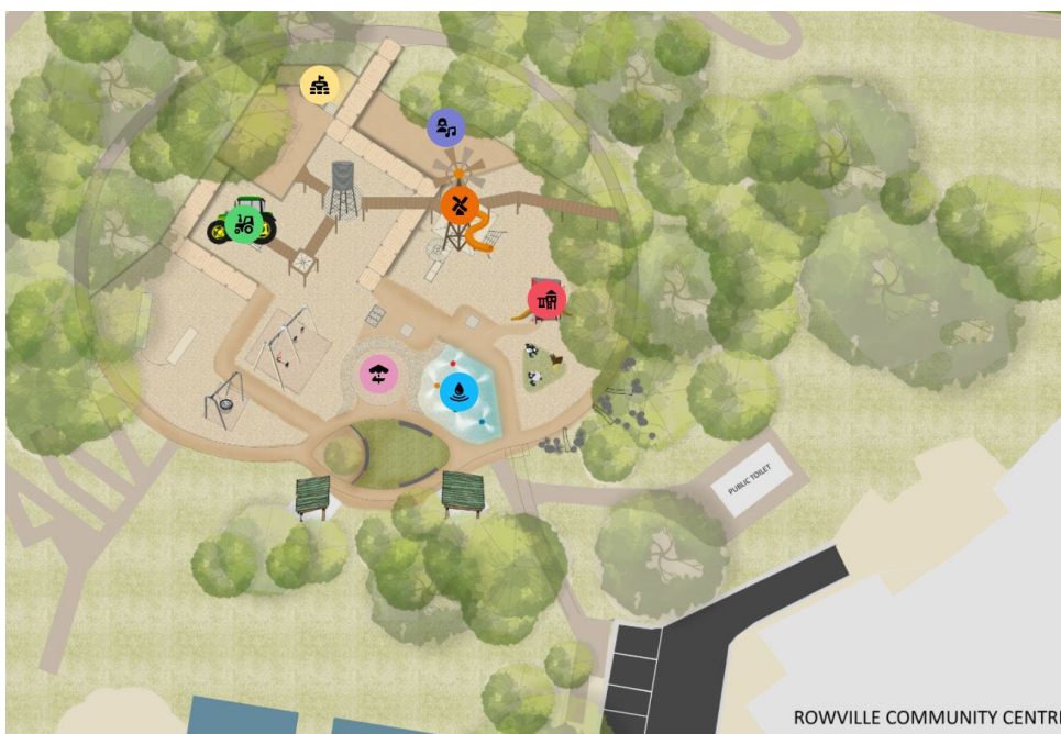
Figure 3. Concept design presented for community comment

The community was invited to provide comment on each of the proposed play space zones.