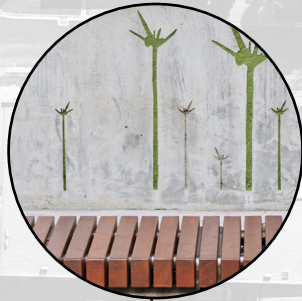
Micro scale art / search and find experience