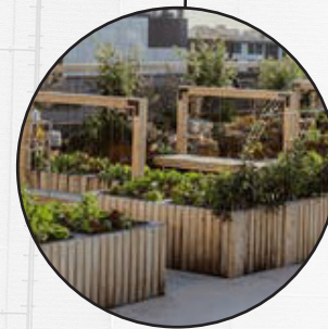
Productive community gardens