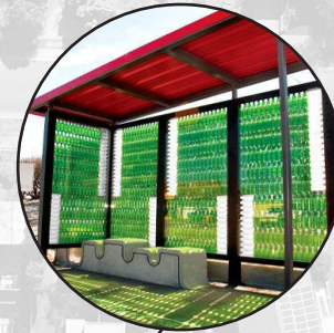
Future Potential Green Spine Bus stop graphics