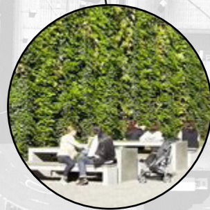
Future potential green facade opportunity