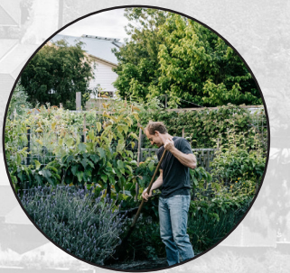
Knox Gardens for Wildlife Program