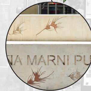
Wayfinding + informational signage