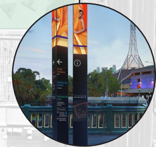
Wayfinding + informational signage