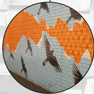
Cultural story telling mural