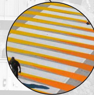
Traffic calming super graphic opportunity