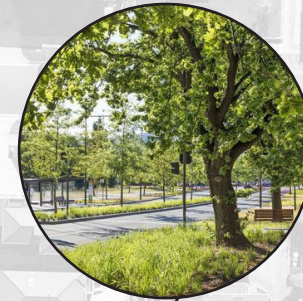
Reduced carriageway width supports biodiversity