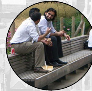
Rest points at key intervals along shared path