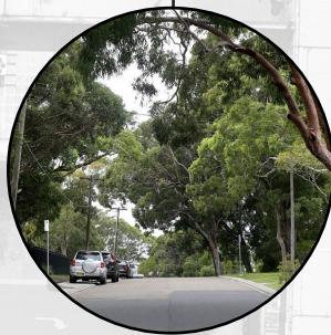
Increased tree canopy through deep soil planting