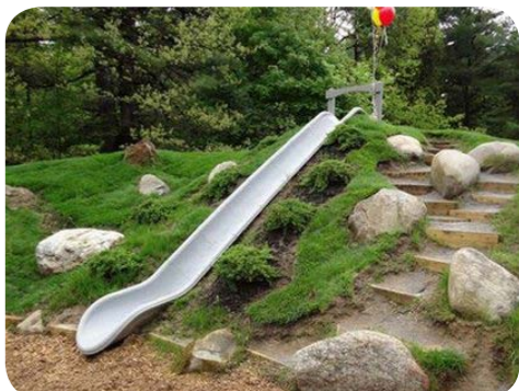
mix of play equipment and natural materials - rocks, plantings etc

Possible future light tower upgrade - according to council facility standards and funding