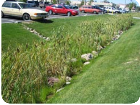
WSUD option for bioswale to filter water runoff