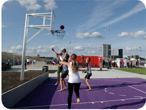
multi-purpose half court with basketball ring