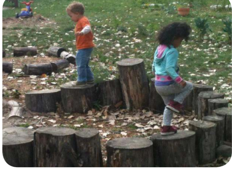
playful, sculptural elements from trunks of removed trees