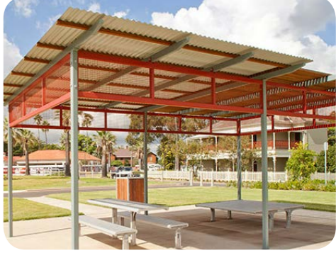
shelter with picnic tables and seating for shade and weather protection